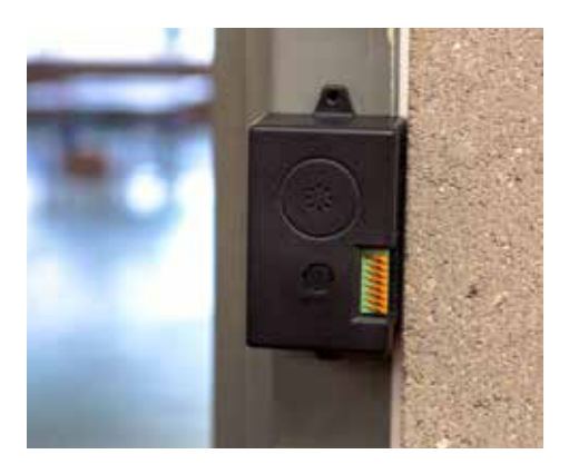
LM Tag<sup>™</sup> can now interface with SONR<sup>™</sup> Echo Box to relay up to 20' and alerts store associates away from the retail area.

theft in stores, including LM Tag<sup>™</sup> Slim, LM Tag<sup>™</sup> 3-Alarm and LM Tag<sup>™</sup> with SONR<sup>™</sup>. Other accessories include the LM Tag<sup>™</sup> Wrap and LM Tag<sup>™</sup> Clip.